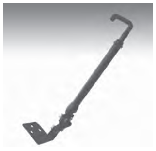
Screen Support - Acd 425-5999

12" flexible wand with blue LED's and rheostat to adjust brightness. Three foot power cord plugs into cigarette lighter.