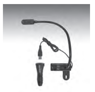
USB Light 425-2490

The Brace Kit attaches to the stand providing additional support. It can be adjusted in length and mounts to flat, vertical or angled surfaces.