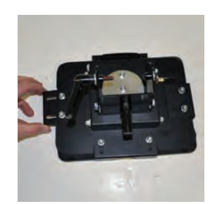
Move all adjustments on Mounting Station to make a snug fit onto tablet.