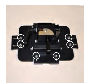
Loosen locknuts on back of Mounting Station. If iPad Air you will need to switch lower bracket out.