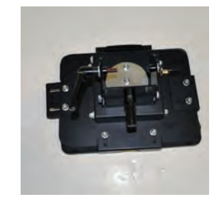
Flip mounting station over onto face.