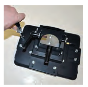
Tighten all locknuts.