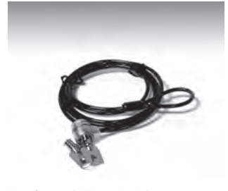
Kensington® Masterlock® 425-1317

12" flexible wand with blue LED's and rheostat to adjust brightness. Three foot power cord plugs into cigarette lighter.