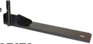
No Holes Base 425-3800