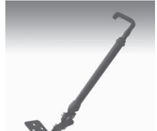
Screen Support - Acd

The Brace Kit attaches to the stand providing additional support. It can be adjusted in length and mounts to flat, vertical or angled surfaces.