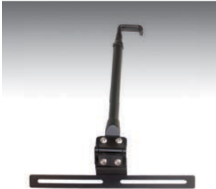
Screen Support - A-Mod

Computer securing system uses Kensington locking system. Fasten security cable to permanent structure in vehicle.