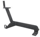
No Holes Base 425-2996