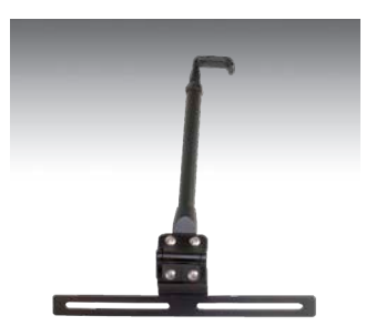
SCREEN SUPPORT - A-MOD

Computer securing system uses Kensington locking system. Fasten security cable to permanent structure in vehicle.