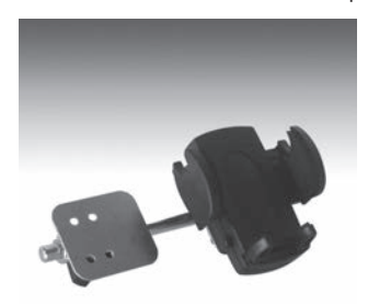
PIVOTING CELL PHONE HOLDER

Specifications subject to change without notice