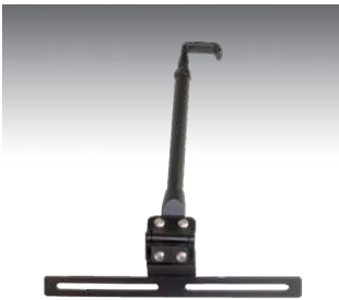
SCREEN SUPPORT - A-MOD

Computer securing system uses Kensington locking system. Fasten security cable to permanent structure in vehicle.