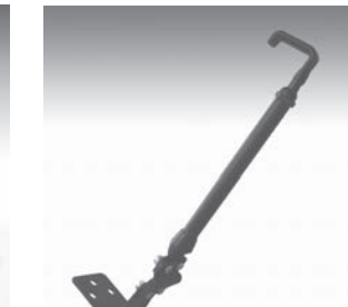
SCREEN SUPPORT - ACD

The Brace Kit attaches to the stand providing additional support. It can be adjusted in length and mounts to flat, vertical or angled surfaces.