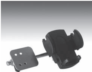
PIVOTING CELL PHONE HOLDER

Specifications subject to change without notice