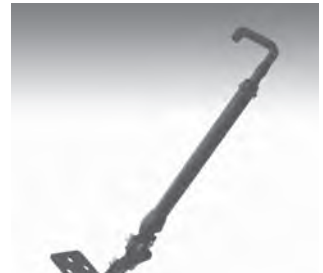
Screen Support - Acd

The Brace Kit attaches to the stand providing additional support. It can be adjusted in length and mounts to flat, vertical or angled surfaces.