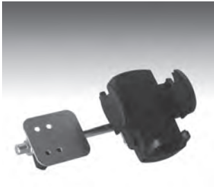
Pivoting Cell Phone Holder

Specifications subject to change without notice.