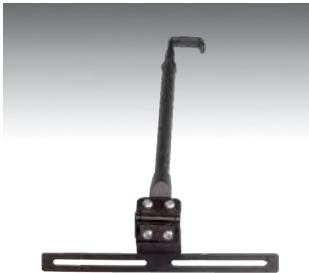
Screen Support - A-Mod

Computer securing system uses Kensington locking system. Fasten security cable to permanent structure in vehicle.