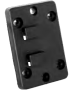
Position for landscape orientation.