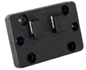
Position for portrait orientation.