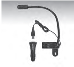
USB Light 425-2490

Allows you to tilt your phone independent of the desktop angle. Mounts to side of 10" x 12" Desktop.