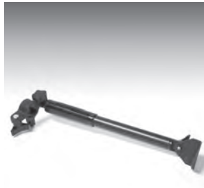
Brace Kit 425-5238

The Screen Support is designed to keep your screen in place while you use your computer. It attaches directly to the A-MOD Desktop and adjusts in height and tilt angle.