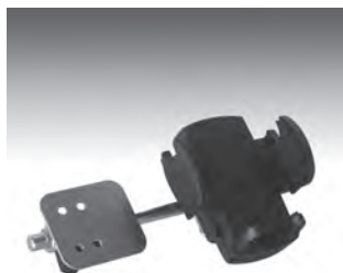
Pivoting Cell Phone Holder

Specifications subject to change without notice.