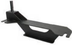
No Holes Base 425-6672